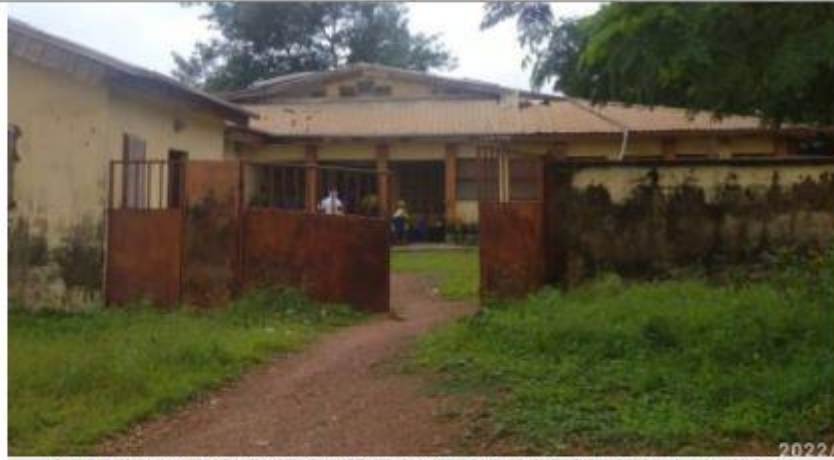
Awotan Orisun Healthcare Centre, Origbaketun Awotan, Ido Local Government Area (LGA), Oyo state