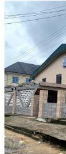
PHC Bogobiri (inside Apostrophe) operate at the benevolence