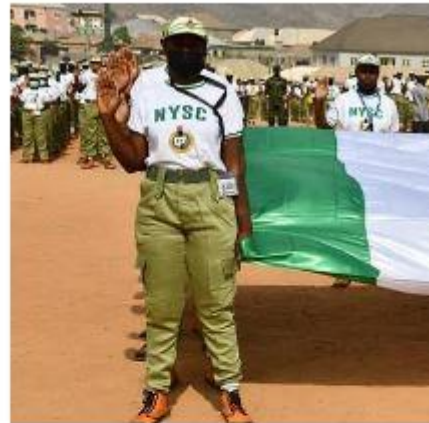
Illustrated photo of corps members holding the Nigerian flag